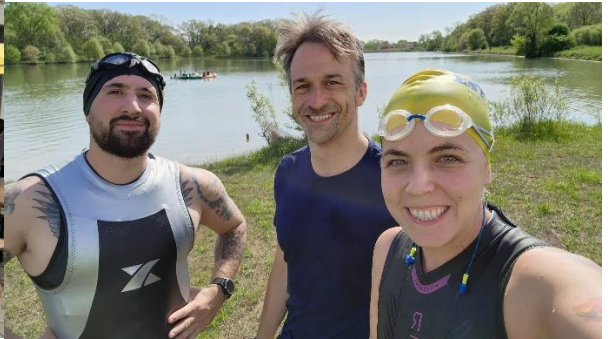
Impromptu Swim Clinic @ Robinson Lake

May 28 - Group Bike Ride starting from Liberty Church in Valpo